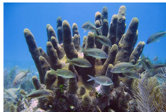
Pillar coral with fish.