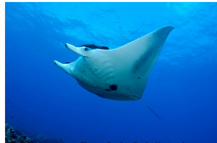
Giant manta ray in Flower Garden Banks National Marine Sanctuary.