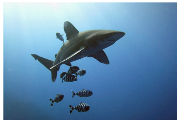
Oceanic whitetip shark.