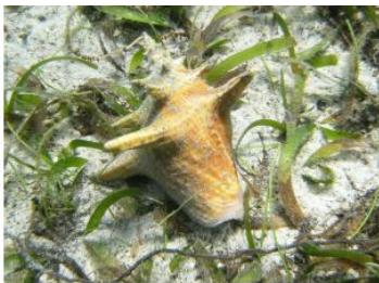
Figure 1: Juvenile queen conch in seagrass.